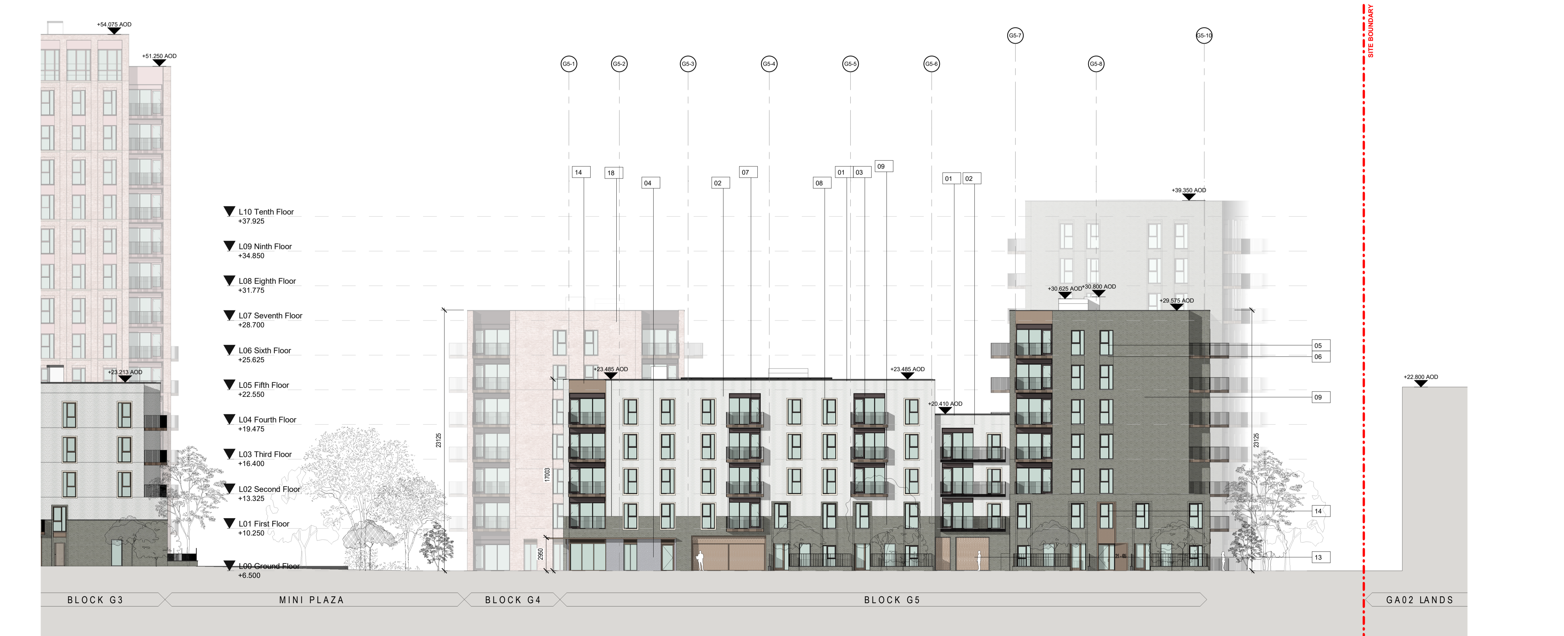
2 SOUTH ELEVATION 1:200